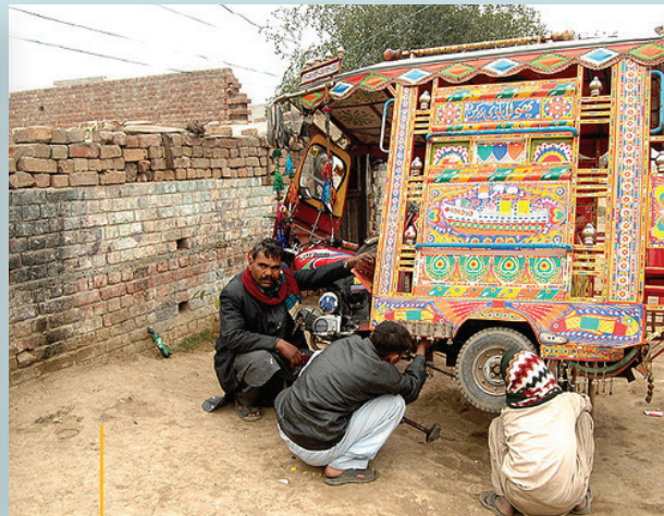
Men fixing a rickshaw (cab) in Lahore Pakistan, 2008.

The Verizon Wireless Domestic Violence Entrepreneurship Program provides funds to help survivors get a small or home business up and running.