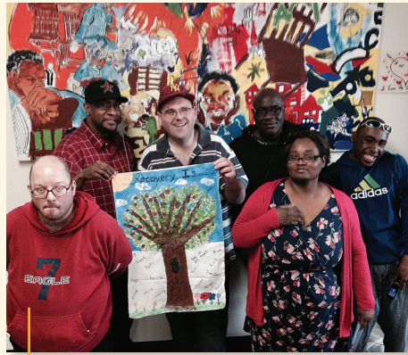
PROS participants proudly display their art project.